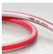
Model :Quattroflex top Dimension : 13 mm , 19 mm Burst pressure : 50 bar