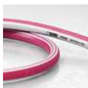
Model :Quattro flex profi Dimension : 13 mm , 19 mm Burst pressure : 50 bar