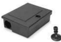
Rat Bait station