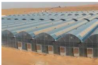
Hydroponic green houses- BK Green houses