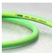
Model :Green line Dimension : 13 mm , 19 mm Burst pressure : 30 bar