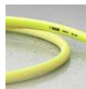
Model :Pro line Dimension : 13 mm , 19 mm Burst pressure : 30 bar