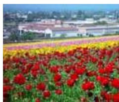
Heikes speciality Flower seeds