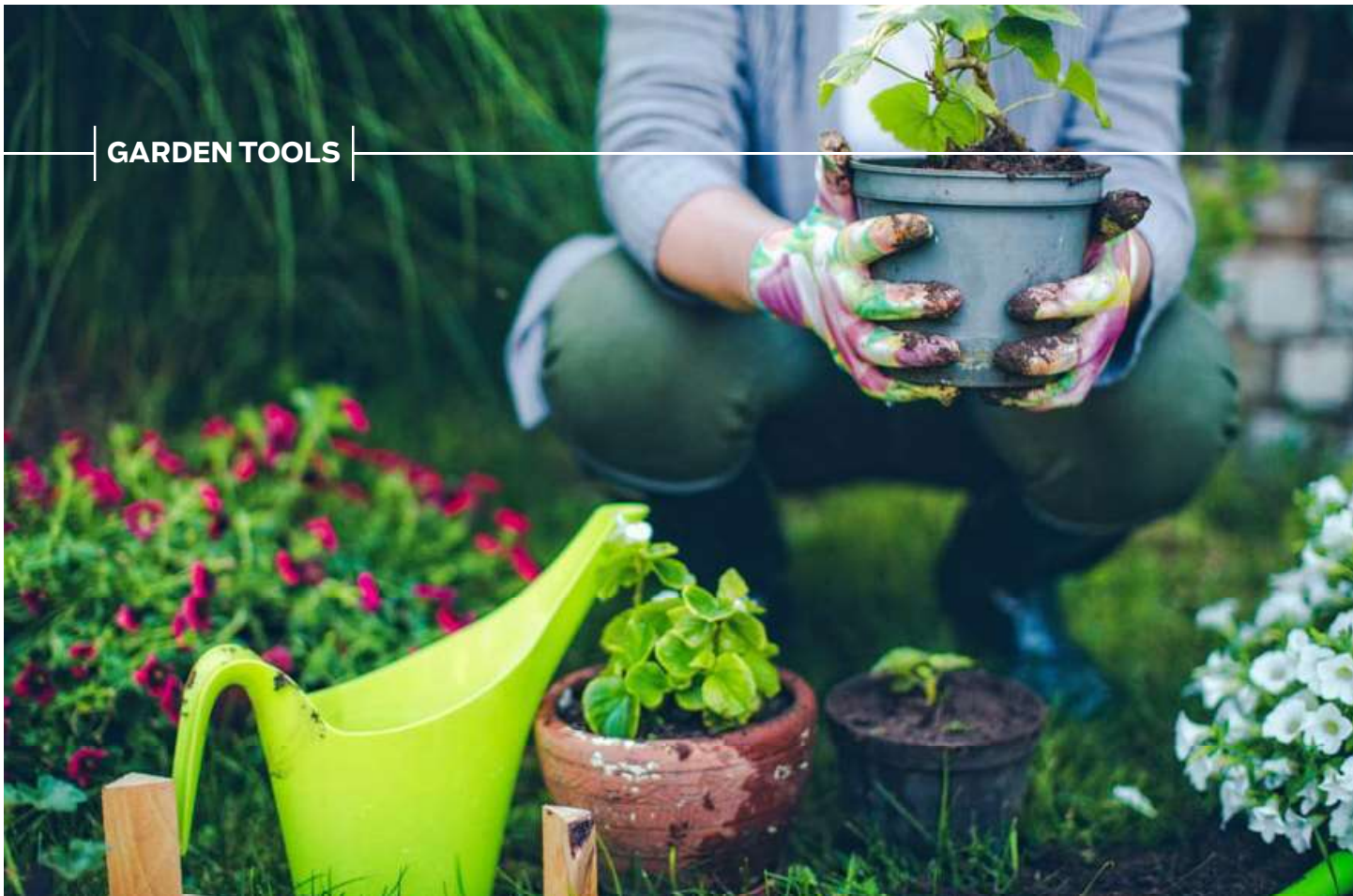
Kamaki Garden Tools