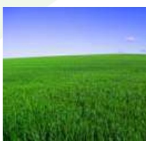
Arizona Seed Technology, Inc. Arizona Bermuda grass seeds