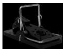
Mouse snap trap