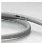
Model :Eco Dimension : 13 mm , 19 mm Burst pressure : 30 bar