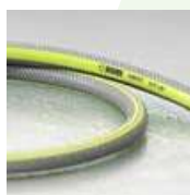
Model :Slide line Dimension : 13 mm , 19 mm Burst pressure : 30 bar