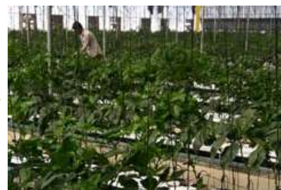
Automated green house- BK Green houses